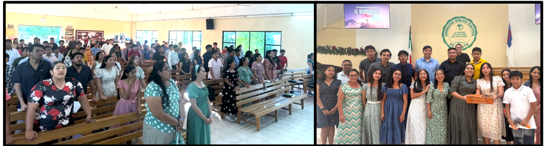
Youth Camp Service - Surrender and Consecration

I also want to share a glimpse of God's ongoing work in the ministry. We recently concluded our youth camp, and we are rejoicing over what the Lord has done! There were over 200 that attended, the preaching was powerful, and the Spirit of God moved mightily. Five answered God's call to full-time ministry, and many others made heartfelt decisions for deeper consecration. We give all glory to God for His faithfulness and the fruit we're seeing in the lives of these young people.